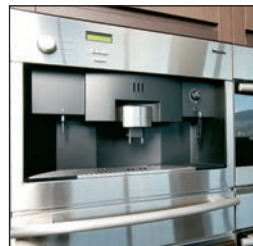
MIELE BUILT-IN STAINLESS STEEL COFFEE MAKER 1