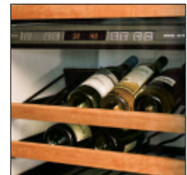
SUB-ZERO WINE STORAGE 1