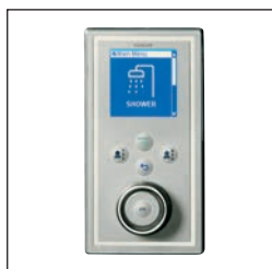
KOHLER DTV ONE-TOUCH SHOWER CONTROL