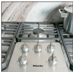
MIELE 36" STAINLESS STEEL FIVE-BURNER GAS COOKTOP 1