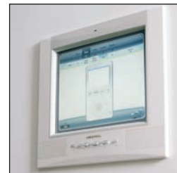
MOTORIZED WINDOW SHADES