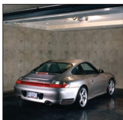
PRIVATE GARAGE 2