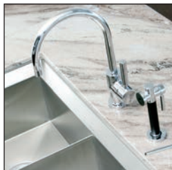
DORNBRACHT TARA CLASSIC MIXER