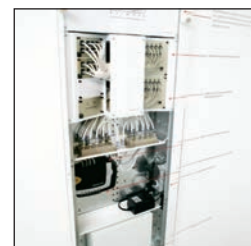
FULLY INTEGRATED TELECOMMUNICATIONS