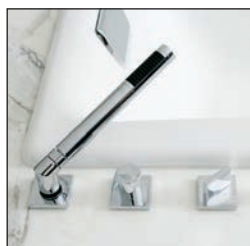
DORNBRACHT MEM POLISHED CHROME BATHTUB FIXTURES