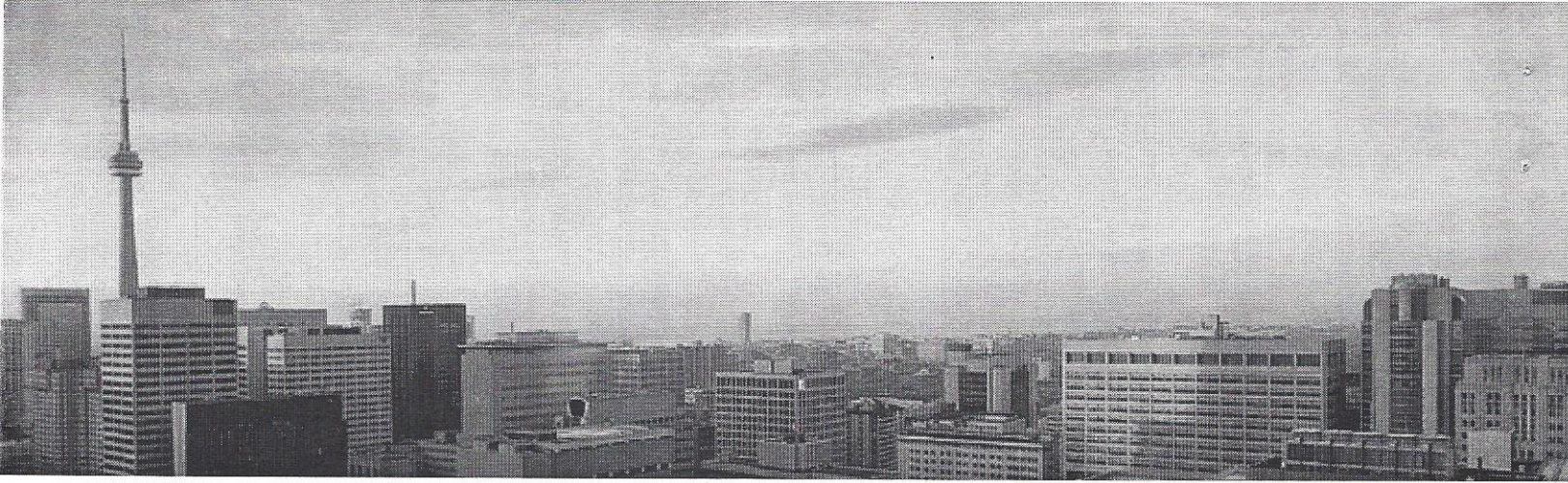
West view from this suite